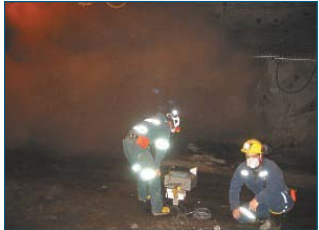
Figure 2: Testing the operation of the millimetre-wave sensor through a cloud of cement dust in a nickel mine

was tested side-by-side with the millimetre-wave sensor. To simulate an opaque dust cloud, a bag of cement and ore dust was dispersed in a mine tunnel using compressed air and powerful fans as shown in Figure 2.