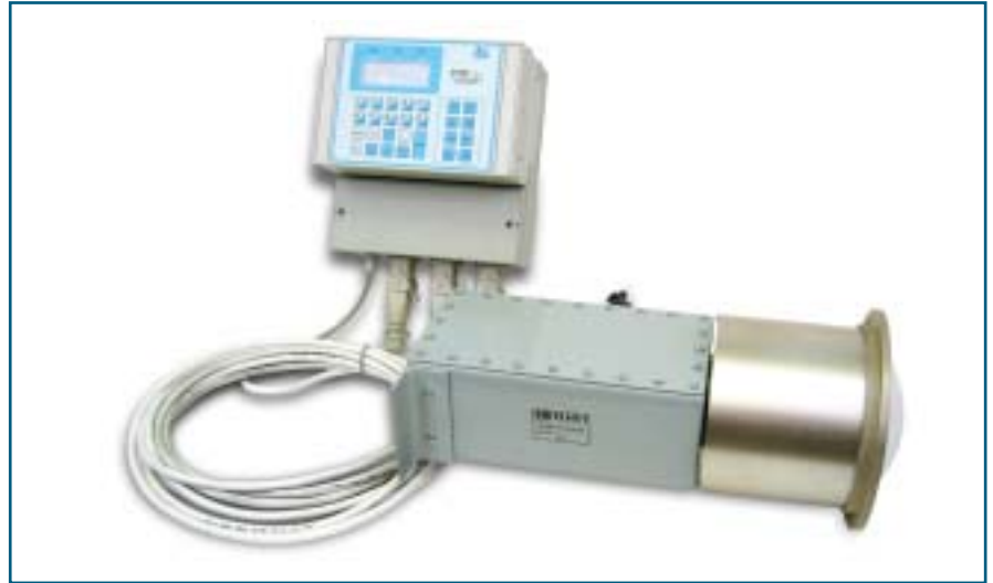
Figure 1: The ELVA-1 94GHz FMCW sensor for non-contact level measurement applications

An example of this is the Russian-made ELVA-1 FMCW 94/10 millimetre wave distance sensor, which is a high-accuracy non-contact level measurement system that has been designed for use in measuring large volumes of bulk materials in hoppers and silos at mineral extraction sites and chemical plants, to control raw material inventory. Examples of its use are found in hard-rock mines, cement hoppers, and other large receptacles that suffer from adverse environmental conditions such as dust, corrosive gas, fog, or high-level noise. The distance sensor can also be used for liquid level measurement in large industrial tanks where the edge of